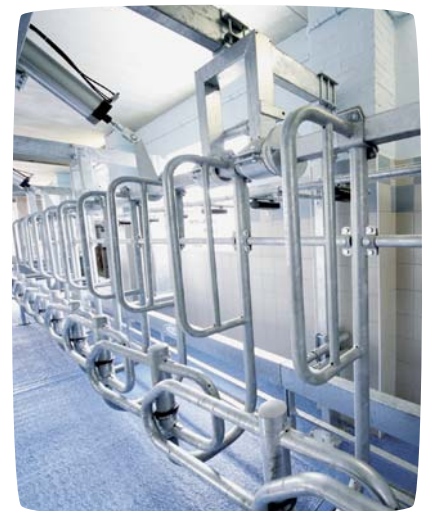
Side by side frame