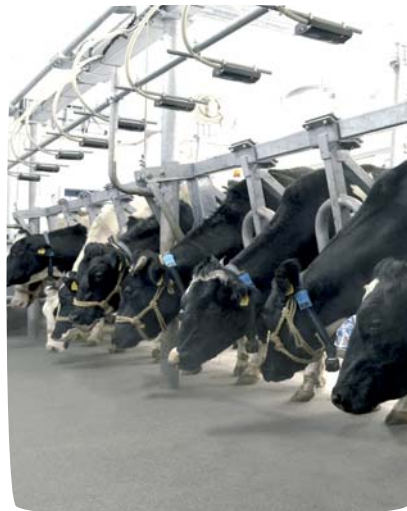
Proactive front barrier during indexing